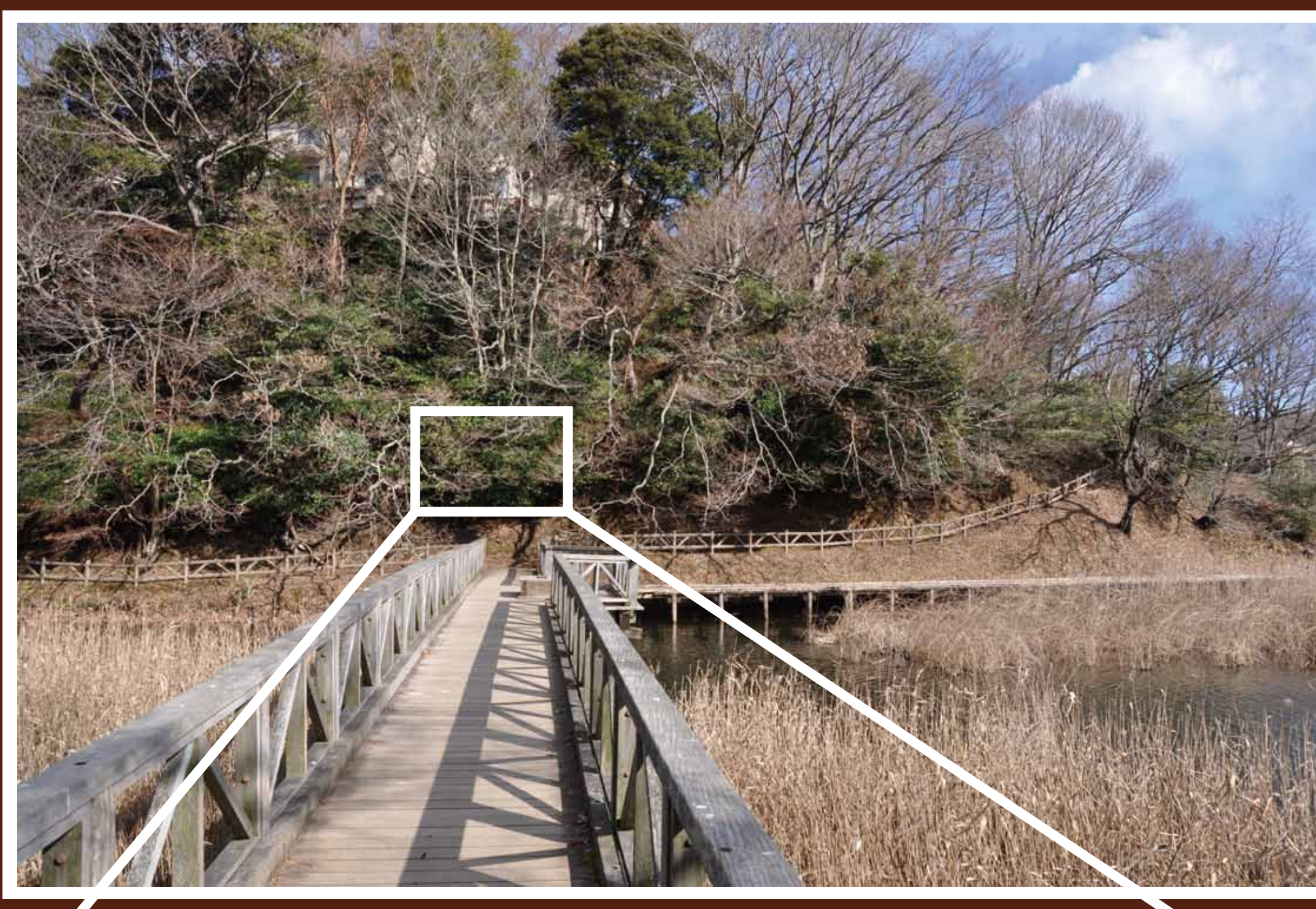
爆発角れき岩の観察できる場所 The places where explosion breccia is observable

Lakes Ippekiko and Numaike are twin craters resulting from an eruption about 100,000 years ago. In this eruption, five volcanoes including the crater lakes were formed along an “eruptive fissure” stretching from the northwest to the southeast. The lakes are part of the depressed area called a maar –the result of an explosive (phreatomagmatic) volcanic eruption. On the cliffs around the maar, you can see explosion breccia and volcanic bombs.