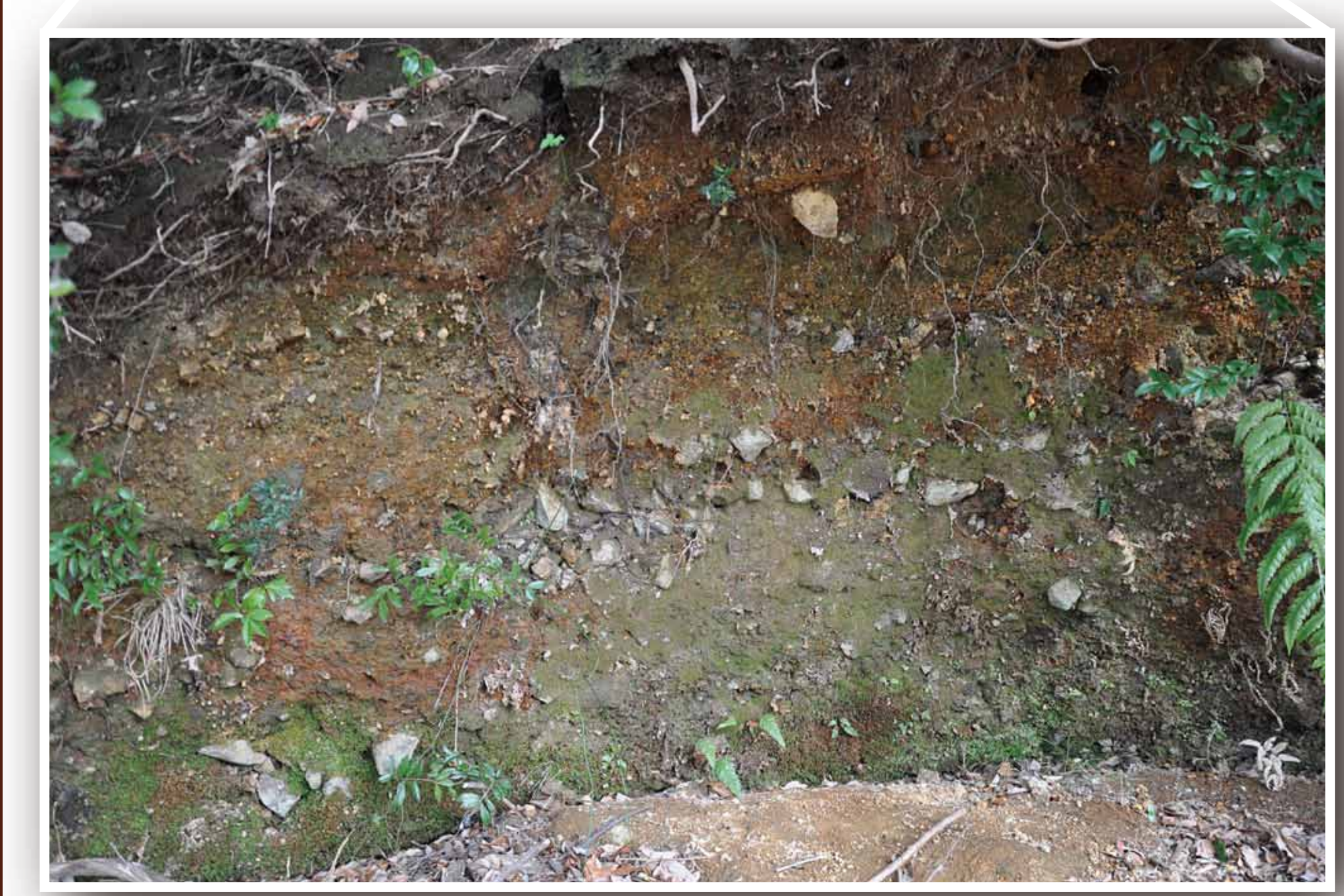
爆発角れき岩 Explosion breccia 爆発的な噴火で飛び散った火山弾を多く含む地層 The layer containing many volcanic bombs which were scattered by the explosive volcanic eruption